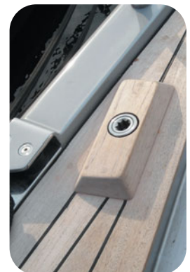
manual backup drive